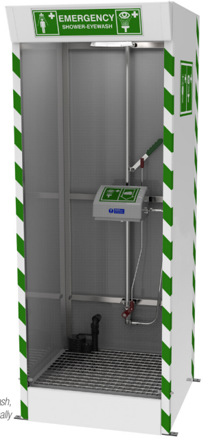
Shown with internally mounted eye wash, can also be mounted externally a

Designed to protect the surrounding area from splashes of surplus contaminated water and to provide a designated decontamination zone, this emergency safety shower with drain sump is housed within a self-contained cubicle. The external side mounted eye/face wash has an integral lid to protect the bowl and diffusers from dust and pollutants. Meets the recommendations stipulated in EN15154 and ANSI Z358.1-2014 standards.